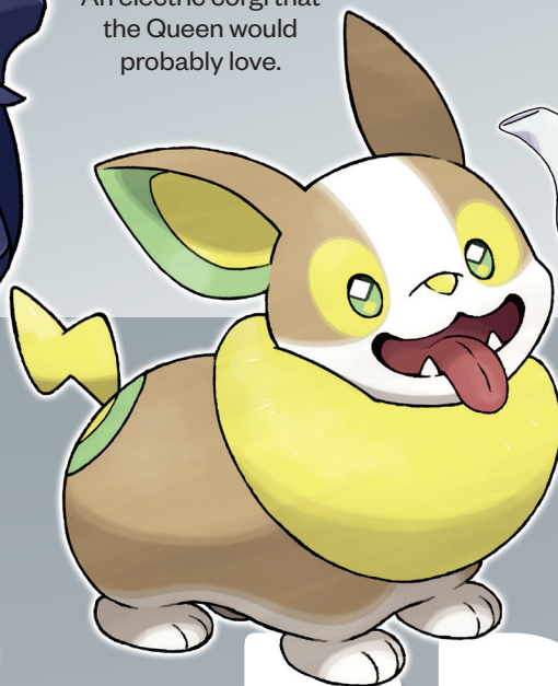
Yamper An electric corgi that the Queen would probably love.