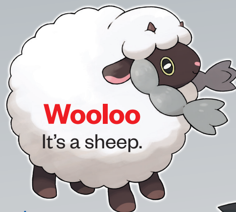
Wooloo It's a sheep.

A seafaring bird that must be inspired by the real-life cormorant.