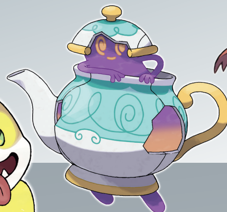
Polteageist It's a ghost that lives in a teapot – spooky!