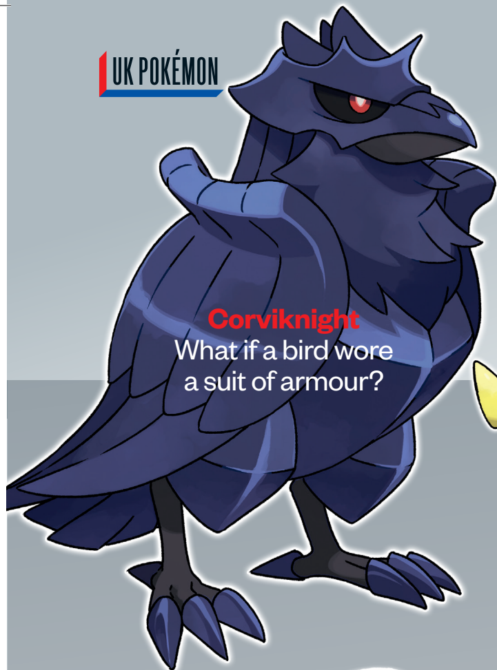
Corviknight What if a bird wore a suit of armour?